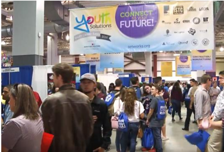
Fall 2018 Youth Career Expo attended by over 3,300 high school students.